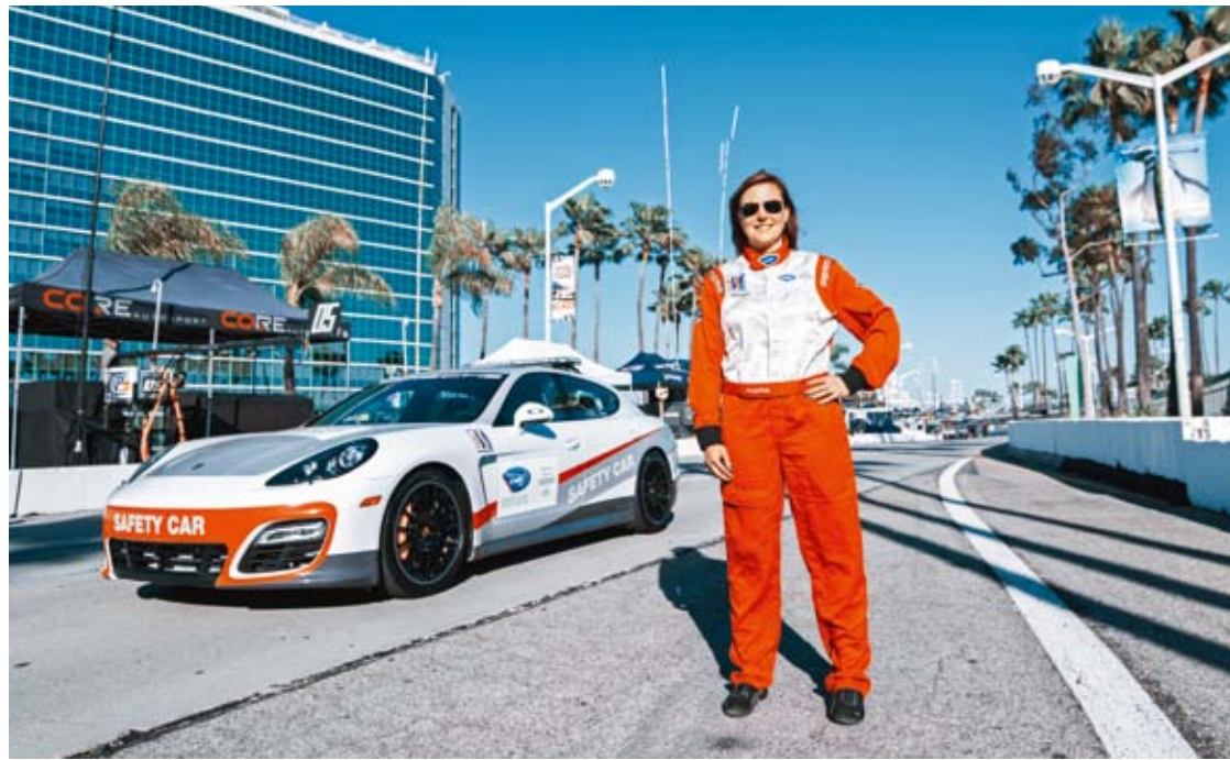
Street circuits demand utmost precision: The ALMS includes city races in Long Beach and Baltimore