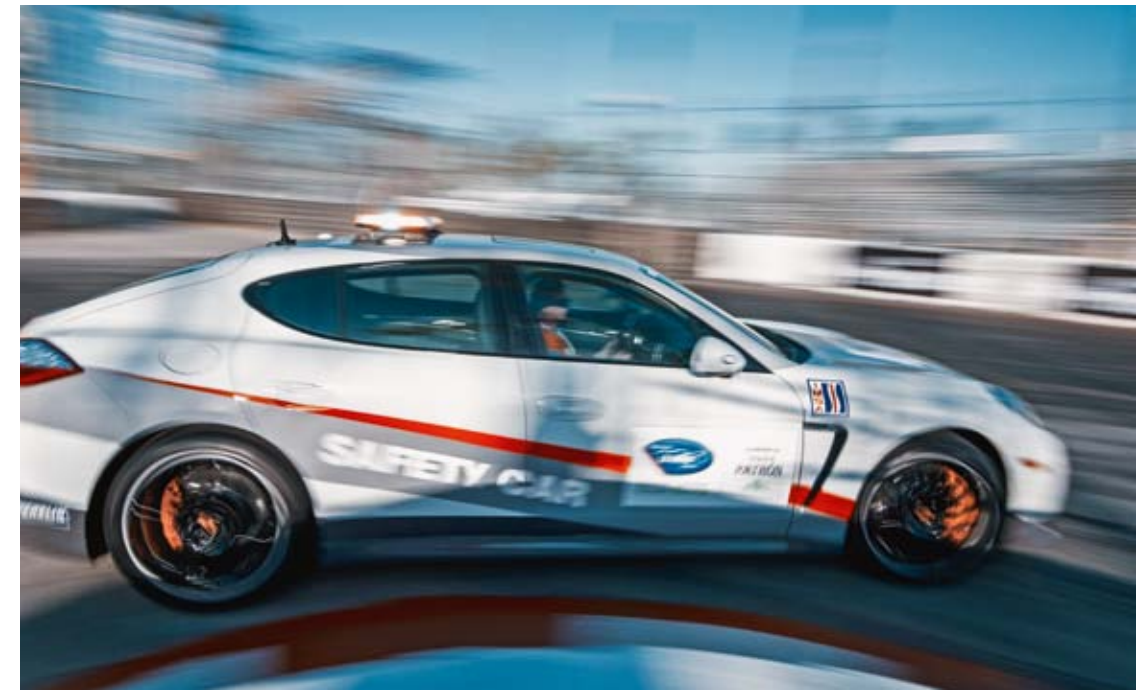
The Panamera safety car is an unmodified standard-production GTS

vehicle to lead the field because the laps driven under a yellow flag are not exactly slow. If the pace is not rapid enough, the race cars' engines will overheat and their tires will cool.